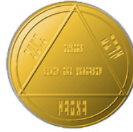
One Hundred Marks