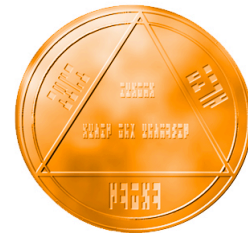
Copper Coin Test Strike 5419

Saerosian and Saerenan Imperial currency is The Mark, with one Mark being the smallest integral denomination; units smaller than One Mark are divided into either fractions (in eights and powers of eights) or tenths (in some regions; thus decimal).