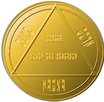
Five Hundred Marks