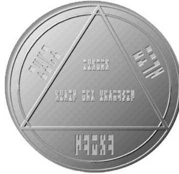
Five Thousand Marks