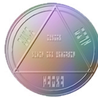
Ten Thousand Marks