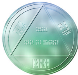
One Hundred Thousand Marks