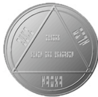
One Thousand Marks